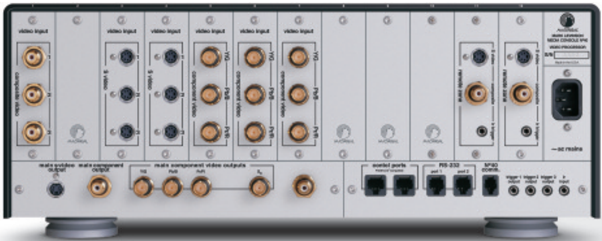
Standard configuration shown.