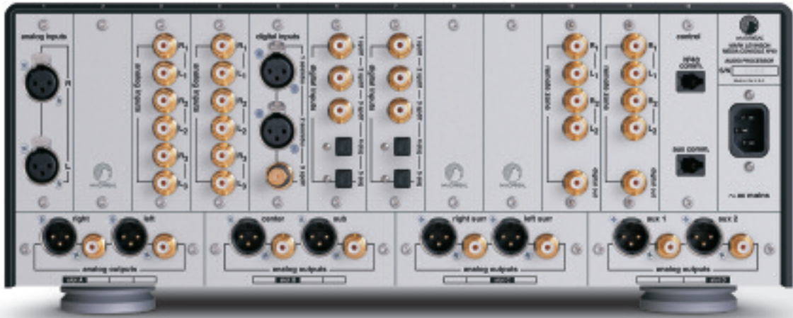
Standard configuration shown.