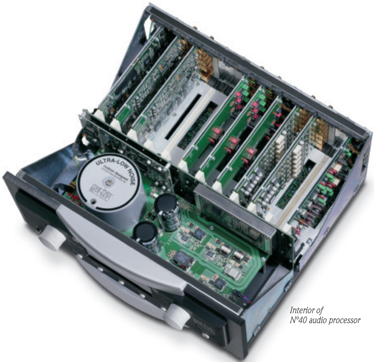
Interior of N°40 audio processor

Digital processing, digital-to-analog conversion, volume control and analog output circuitry all benefit from the latest Mark Levinson technology. Even avowed two-channel music lovers may become enthusiastic multichannel music listeners, when they hear what real ambience recreation in a listening environment sounds like through the N°40.