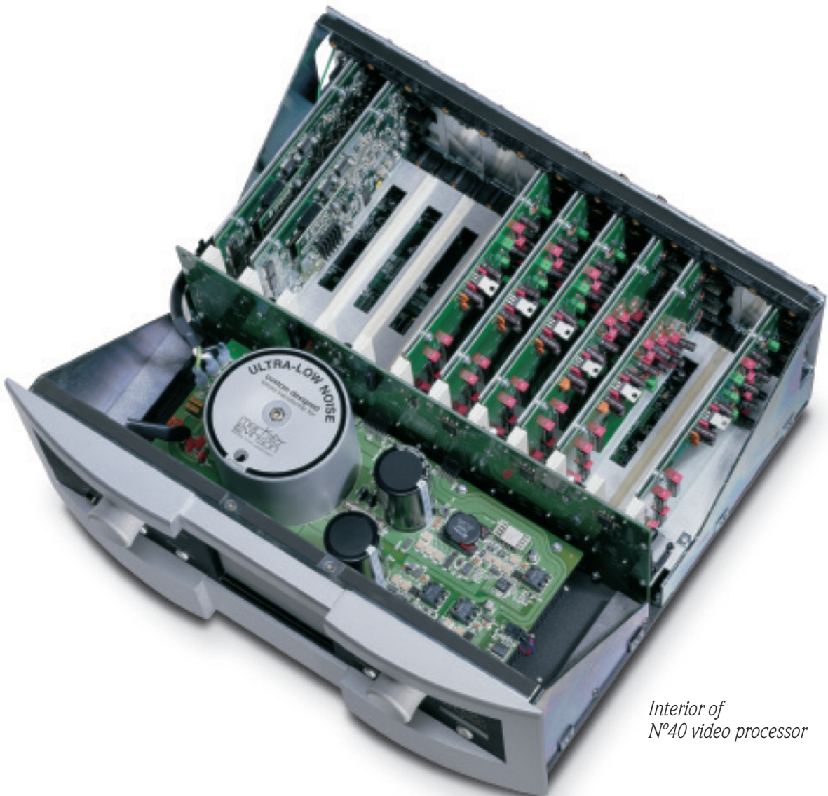
Interior of N°40 video processor

The N°40 provides an outstanding mix of all three factors. In cases where simplification was necessary, ease of initial setup was compromised in support of functionality and ease of use. After all, most of us set a system like this up only once, but rely on its functionality and ease of use every day.